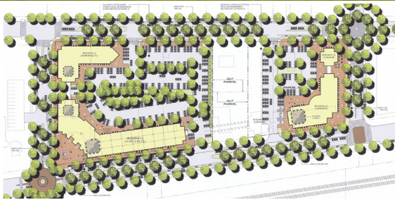
Conceptual Master Plan of the site.