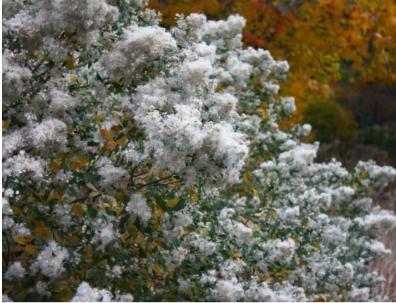
Baccharis blooming during the fall.

Common Name: Groundsel bush Scientific Name: Baccharis halimifolia Size: 8'-12' tall x 6'-12' wide