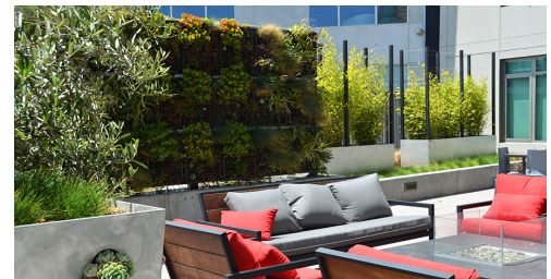
An example of a SITES initiative pilot site located in San Francisco, CA

For more information visit: http://www.sustainablesites.org/