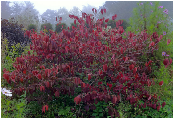
Viburnum showing off its fall colors.

Common Name: 'Summer Snowflake' Doublefile Viburnum Scientific Name: Viburnum plicatum tomentosum Size: 6'-8' tall x 10' wide